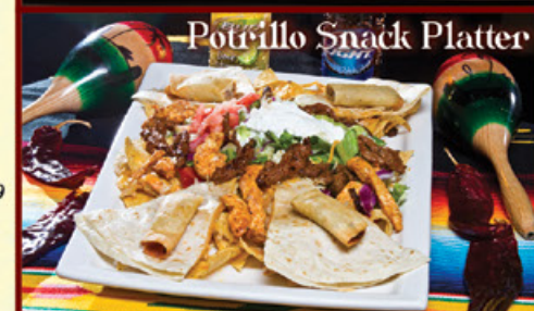
Potrillo Snack Platter