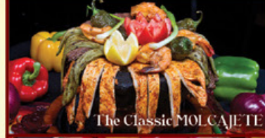
The Classic MOLCAJETE